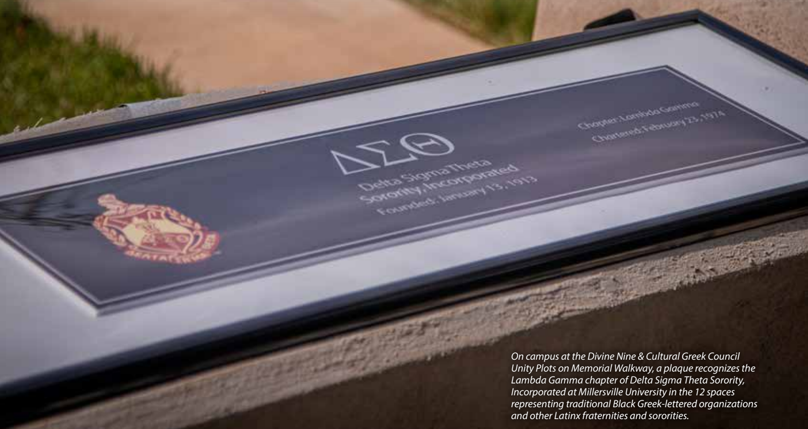
On campus at the Divine Nine & Cultural Greek Council Unity Plots on Memorial Walkway, a plaque recognizes the Lambda Gamma chapter of Delta Sigma Theta Sorority, Incorporated at Millersville University in the 12 spaces representing traditional Black Greek-lettered organizations and other Latinx fraternities and sororities.