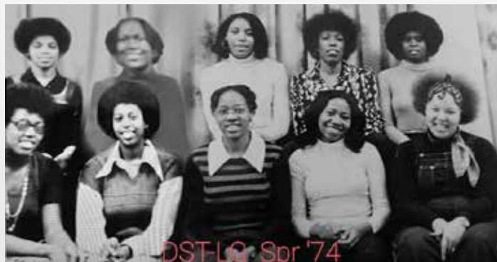
The 10 original charter members of the Lambda Gamma chapter of Delta Sigma Theta Sorority, Inc., at Millersville State College in 1974.