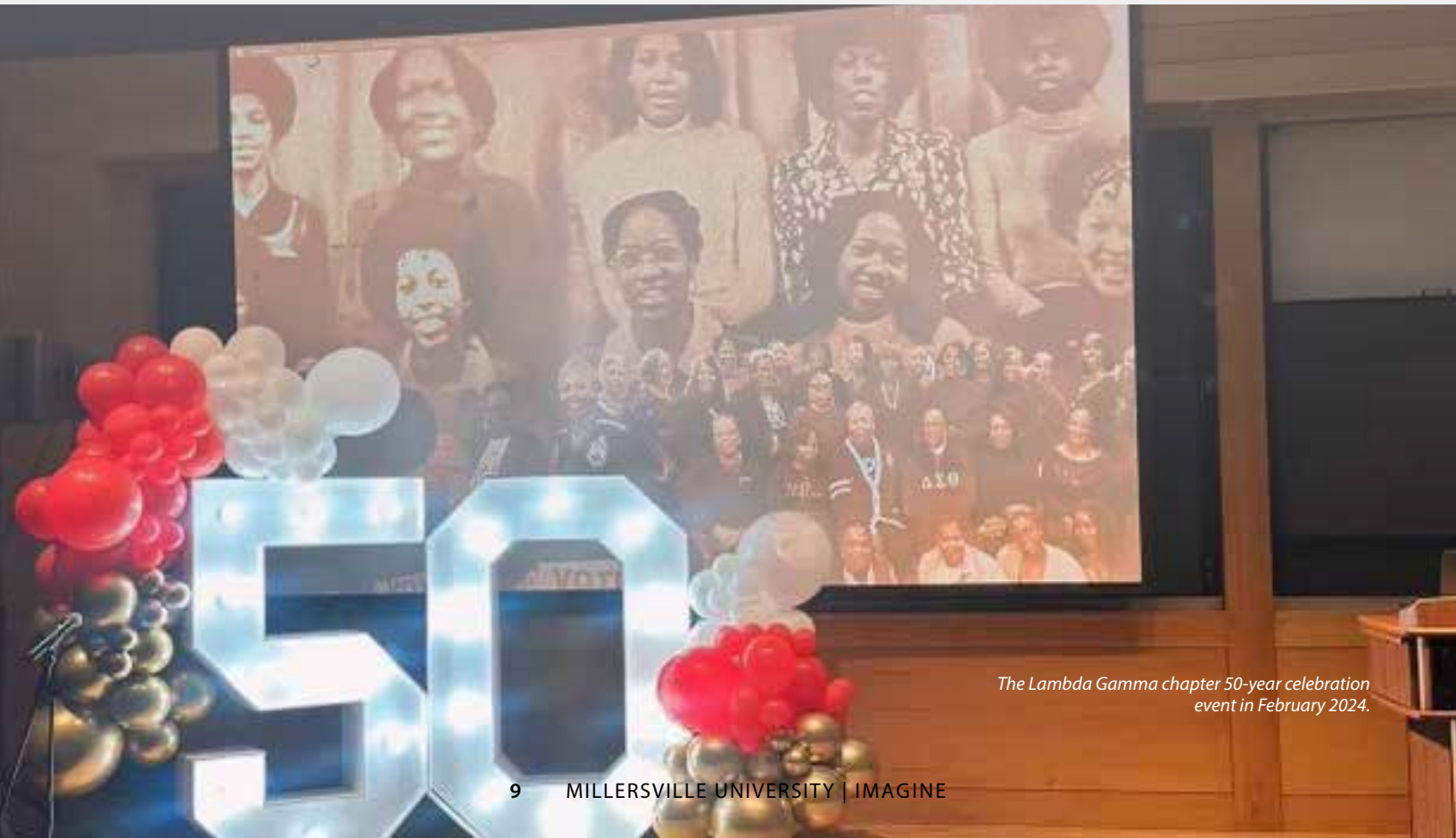
The Lambda Gamma chapter 50-year celebration event in February 2024.