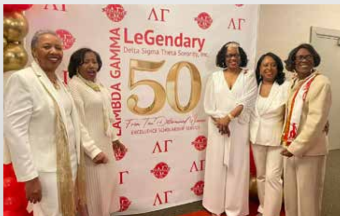
Members of the Lambda Gamma chapter of Delta Sigma Theta Sorority, Inc., at their 50th anniversary celebration.