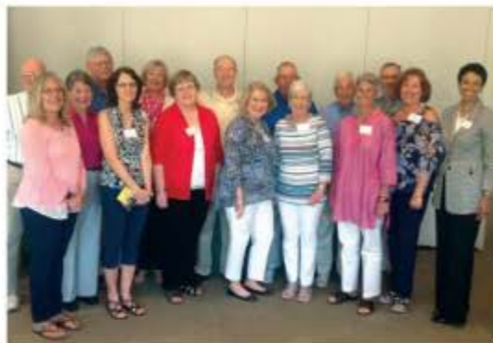
ALUMNI GATHERING IN SARASOTA, FLA.