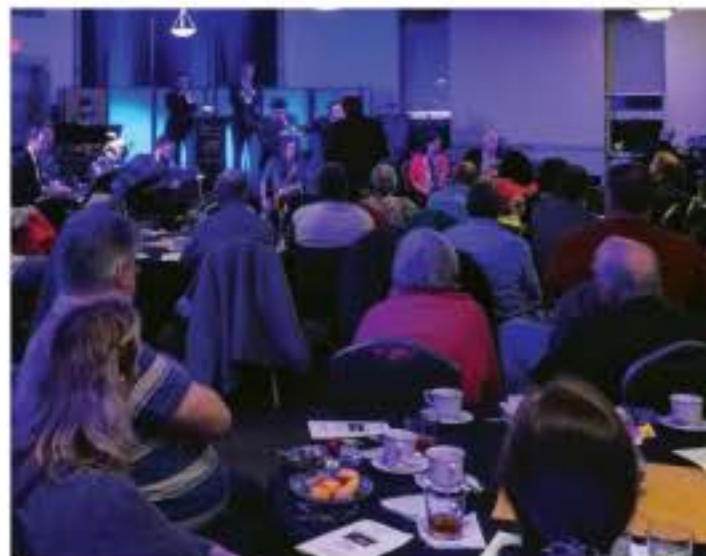
JAZZ &amp; JAVA