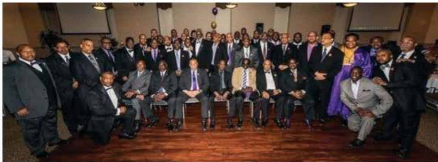
OMEGA PSI PHI FRATERNITY