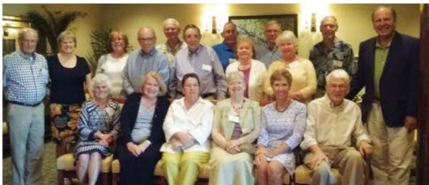
ALUMNI GATHERING IN NAPLES, FLA.