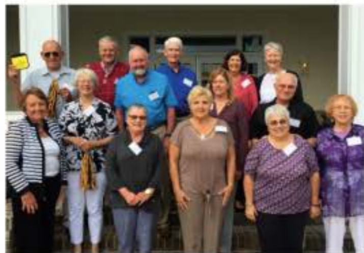
ALUMNI GATHERING AT THE VILLAGES, FLA.