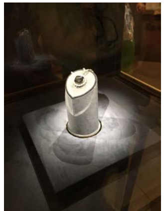
The Hope Diamond - over 45 Carats