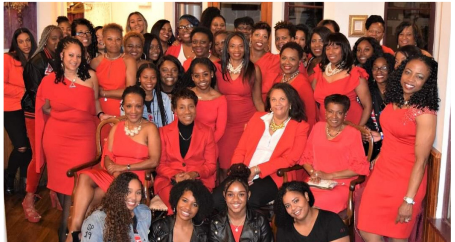
Members of the Lambda Gamma Chapter of Delta Sigma Theta Sorority Inc. celebrate their 45th Chapter Anniversary at Millersville University.

Divine Nine & Cultural Greek Council Unity Plots on Memorial Walkway located along Shenks Lane, near the Student Memorial Center.