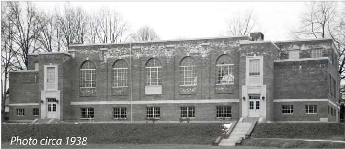
Photo circa 1938