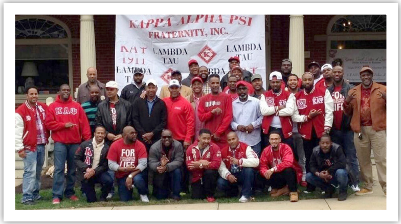
Alumni members from the Lambda Tau Chapter of Kappa Alpha Psi Fraternity Inc. return to campus for Homecoming reunions.