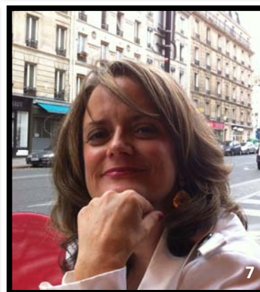
1) Petting gray whales in San Ignacio Lagoon, Baja, Mexico 2) Dia de los Muertos in La Paz, Mexico 3) Swimming with sweet piggies in Exuma, Bahamas 4) Posing with a statue in Havana, Cuba.5) Hiking Pacaya Volcano in Guatemala 6) "Kissing" a mountain goat at the Squamish Lil'Wat Cultural Centre in Whistler, Canada 7) Sitting at a cafe in Paris, France